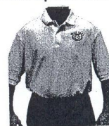
Polo Sports Shirt