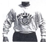
Men's Uniform T-Shirt - L/S