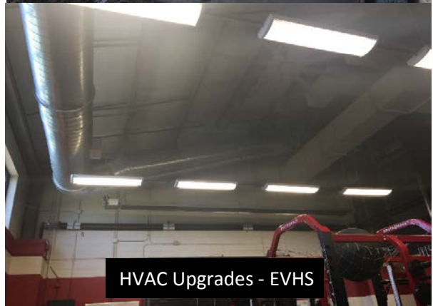
HVAC Upgrades - EVHS

EMA has completed the construction documents. A GMP has been received and will be presented to the Board of Trustees at the April 11, 2016 meeting. A pre-construction meeting was held on April 19, 2016. Contractor has begun work. Contractor has completed the work at the EVHS athletic building. Work at the GHS Fine Arts and PAC is on-going. Boiler and Chiller have been installed at the Fine Arts area.