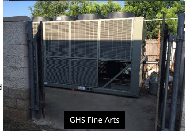
GHS Fine Arts

Replace chillers/boilers/HVAC at GHS Fine Arts and PAC HVAC upgrades to EVHS Weight Room