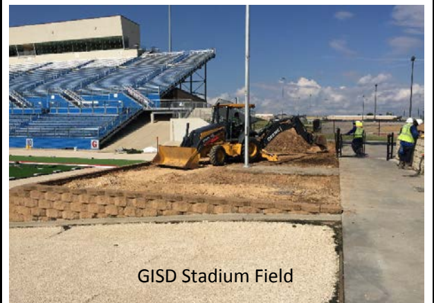
GISD Stadium Field