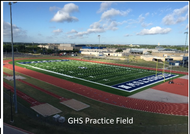
GHS Practice Field